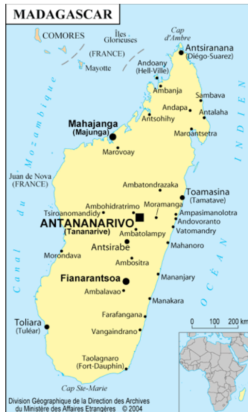
Figure 2. Map of cities of Madagascar: Morondava, Antananarivo, Moramanga. Andasibe is not shown here, but is just to the east of Moramanga.

adorned with zebu skulls. Within these tombs lie prominent or cherished ancestors from the village who provided valuable services to the community; for example, one tomb contained the body of a dentist from the